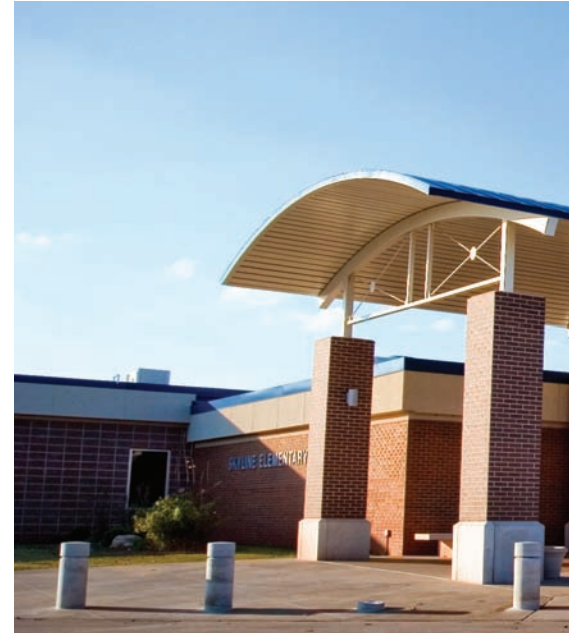
Skyline Elementary School, Entry

With our strong ties to architectural firms across our four-state region, we are able to provide clients with comprehensive services for design and construction work on any new build or remodel project. By merging all job functions and all design and construction processes under one project lead, we are able to streamline clients' projects. From design work to securing permits, engaging subcontractors, and finishing construction, let Lambert maximize your project's efficiency and economy by providing you with single-source convenience.