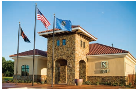
Stillwater National Bank, Sangre Road