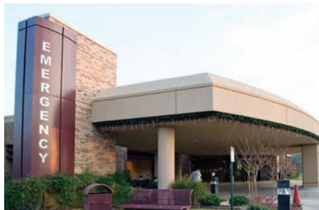
Stillwater Medical Center, Emergency Wing