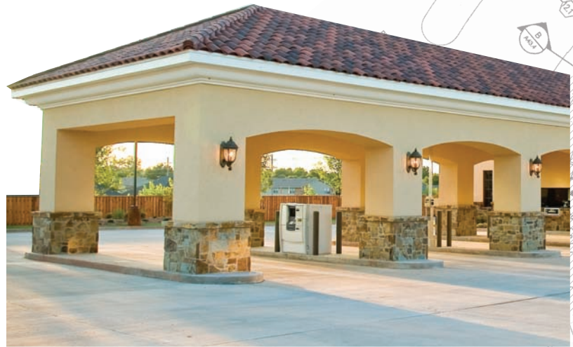
Stillwater National Bank, Sangre Road