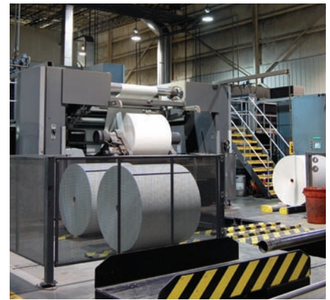
Worldcolor, Press Line

Lambert Construction has extensive experience building retail and commercial structures, including banks, office buildings, retail stores and shopping centers, restaurants, hotels, and sports stadiums. We are experienced in historic preservation and reconstruction, and can modernize any structure to make it work for your business. We build distinctive spaces with finely crafted detail that can set any business apart.