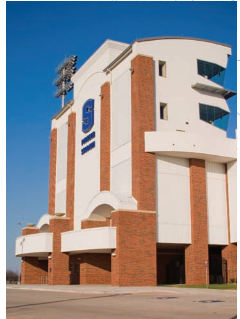
Pioneer Stadium, Stillwater High School